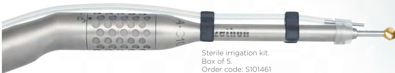
Sterile irrigation kit. Box of 5. Order code: S101461