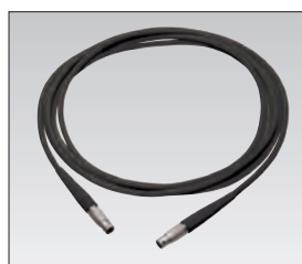
4 metre cable for connecting and charging foot pedals via power console.